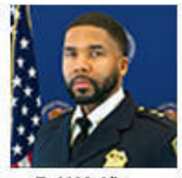
Todd McAlister Community Policing Award