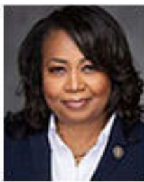
Kimberly Beaty Law Enforcement Leadership Award