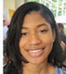
Milan Hood Children of Courage Scholarship