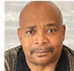
Sturat Barksdale Lifetime Achievement Award