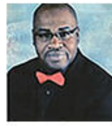
Murray Holman Community Leadership Award