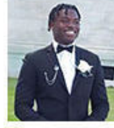
James McNeil Children of Courage Scholarship