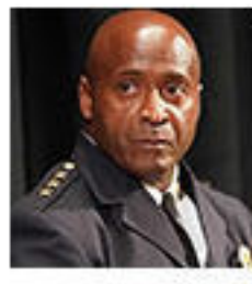
Alphonso Wright Law Enforcement Leadership Award