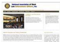
National Association of Black Law Enforcement Officers-Conference Site conference.nableo.org