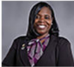
Nekia Kemp Community Service Award